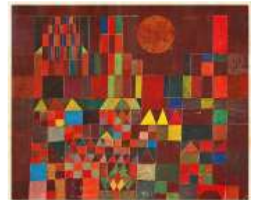
Paul Klee Castle and Sun

Please note that parents are once again able to access the